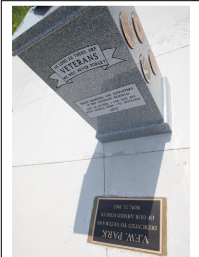
Back side plus copy of the original VFW Park dedication