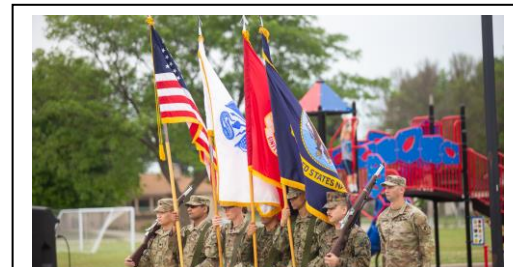
Joint Active Duty Honor Guard – comprised of US Army, US Air Force and US Marine Corps servicemembers