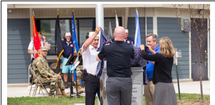
Uncovering the new monument for the 1 st time by the Sponsors - VFW Post 2113, City of De Pere, ISC Insurance & Ryan Funeral Home