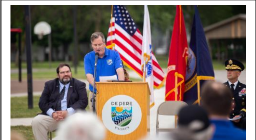
1 st Keynote Speaker – Mayor James Boyd, City of De Pere