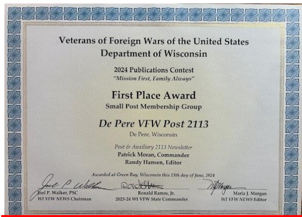
2024 1 st Place Small Post Newsletter