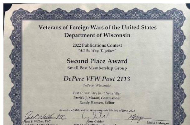
2022 2 nd Place Small Post Newsletter