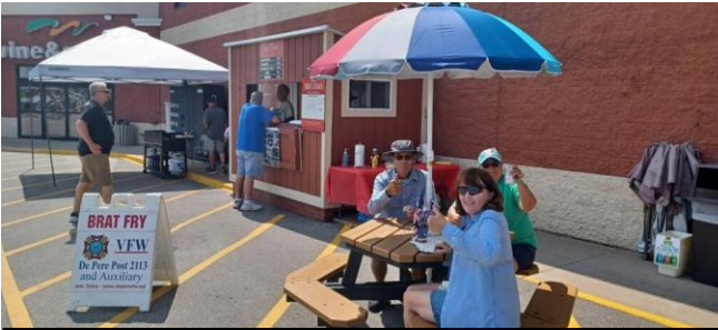
Customer reviews – a solid 3 Thumbs Up – Great Food and Great Service

On July 26, 2024 your Post and Auxiliary held a Brat Fry at the Festival Foods in De Pere. By all the feedback we received from customers it was a rousing success. Many thanks to our Post Auxiliary team for putting together this great event.