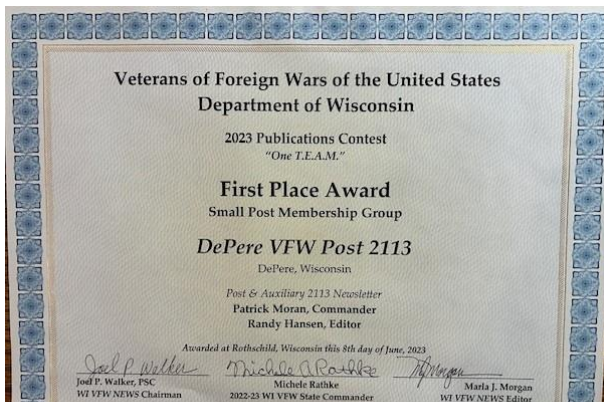
2023 1 st Place Small Post Newsletter